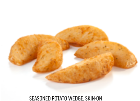
SEASONED POTATO WEDGE, SKIN-ON 56210 05223