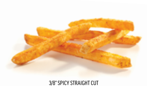
3/8" SPICY STRAIGHT CUT 56210 35101

Already seasoned to perfection, FlavorCrisp fries are a no hassle way to spice up any dish. With their flavorful, crispy coating, FlavorCrisp fries stay hot and tasty longer than uncoated fries and are perfect for customers that like a little zest in their lives and on their plates.