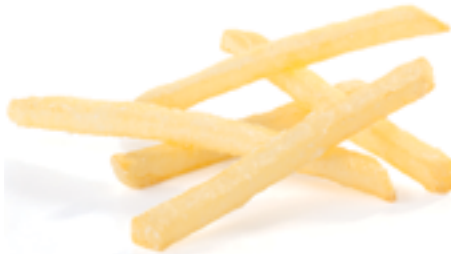
SHOESTRING 56210 05501