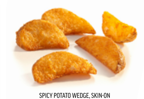
SPICY POTATO WEDGE, SKIN-ON 56210 35119