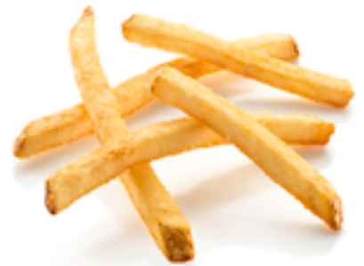
SHOESTRING, SKIN-ON 56210 05521