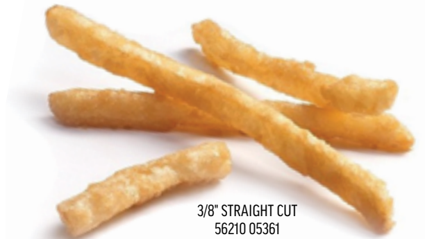
3/8" STRAIGHT CUT 56210 05361