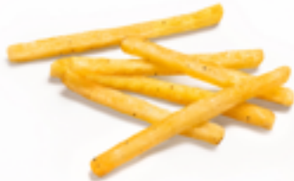
SEASONED THIN CUT FRIES 97644 94824