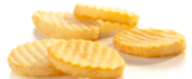
POTATO DOLLARS - CRINKLE SLICES 56210 04014