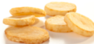
POTATO DOLLARS - REGULAR CUT 56210 04016