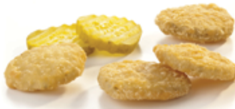
CRISPY TEMPURA PICKLE CHIPS 56210 17147