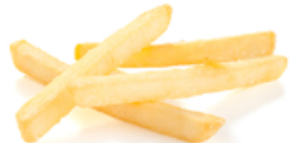
5/16" THIN CUT 56210 05503 56210 05603