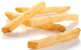
3/8" PUB FRIES™ STRAIGHT CUT, SKIN-ON 56210 05004