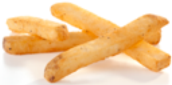
SEASONED THICK CUT FRIES, SKIN-ON 55776 00090

Big on flavor and on crunch, Jersey Shore® products are coated in a signature garlic, sea salt, and cracked black pepper batter which makes them perfect as savory sides or irresistible appetizers. Made with premium, skin-on potatoes, select sweet potatoes and red onions, they're cut thick to offer an unbeatable dining experience. These products are a real fan favorite!