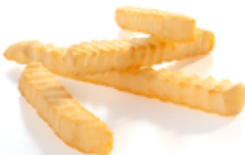
SELECT CLASSIC CRINKLE CUT 56210 34022