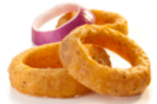
JERSEY SHORE® SPICY RED ONION RINGS 55776 00092