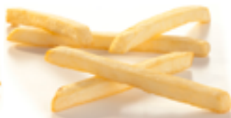
5/16" THIN, STRAIGHT CUT 56210 34001