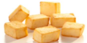
SMALL DICED POTATOES 56210 04119