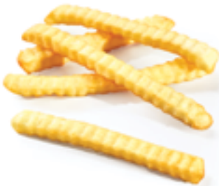
5/16" CRINKLE CUT 56210 99320

Fine Coat XLF fries boast premium, extra-long lengths offering maximum yields for your plates.