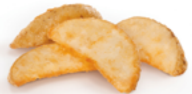
POTATO WEDGE, SKIN-ON 56210 05225