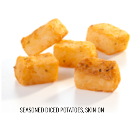
SEASONED DICED POTATOES, SKIN-ON 56210 05222