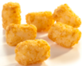
GOLDEN NUGGETS OVENABLE 56210 04101