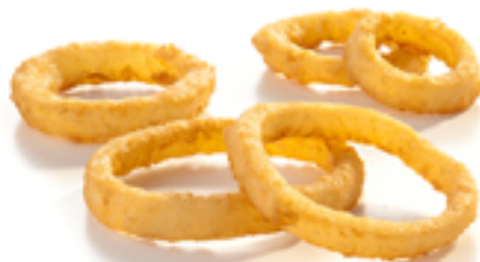
1/4" CRISPY TEMPURA ONION RINGS 56210 15100 - 1 X 2 KG 56210 15105 - 1 X 4 KG 56210 15303 - 60 X 4 OZ FAST PACK™ 56210 15110 - 4 X 60 OZ FAST PACK™