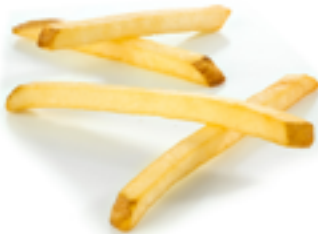
5/16" THIN STRAIGHT CUT, SKIN-ON, BRINED, XLF 56210 30124