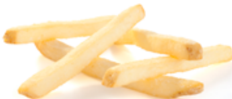
5/16" THIN CUT, SKIN-ON 56210 05505