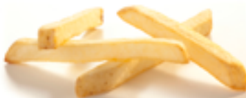
3/8" STRAIGHT CUT, SKIN-ON 56210 04504