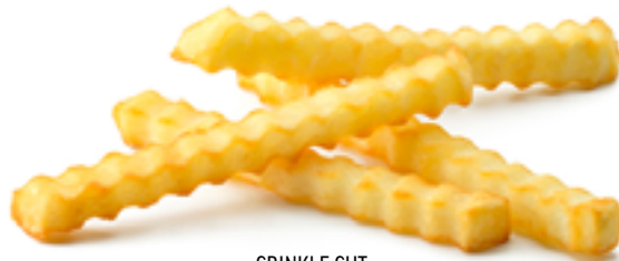
CRINKLE CUT 56210 32006