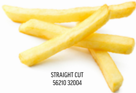
STRAIGHT CUT 56210 32004