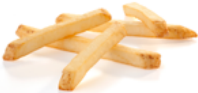
3/8" STRAIGHT CUT, SKIN-ON, BRINED, XLF 56210 30122

These premium, quick to prepare French fries deliver top quality and consistency year round.