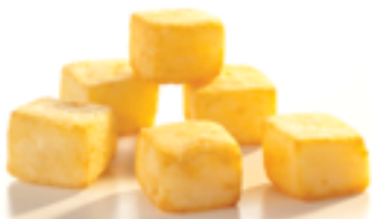
LARGE DICED POTATOES 56210 04109