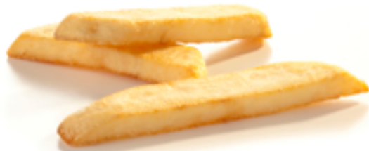
STEAK CUT 56210 32013