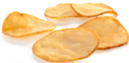
CHIPS, SKIN-ON 56210 20378

Save on the increasing costs of labor and food inflation with FreshCut French fries!