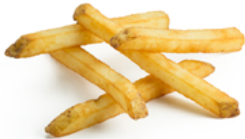
5/16" RUSSET, STRAIGHT CUT SKIN-ON, SEA SALT 56210 04550