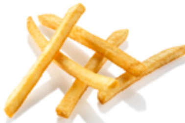
SHOESTRING, XLF 56210 34012