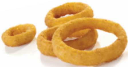
1/2" CRISPY BEER-FLAVORED ONION RINGS 56210 15450