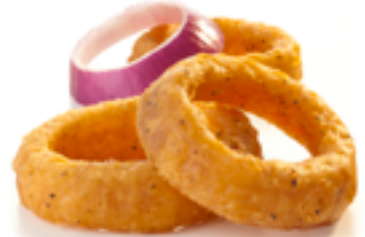
JERSEY SHORE® SPICY RED ONION RINGS 55776 00092