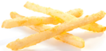
SHOESTRING 56210 05311 56210 05611