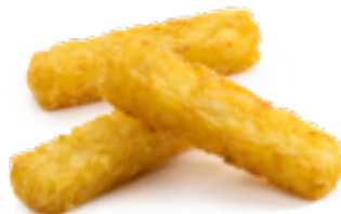
HASH BROWN STICKS 56210 41575