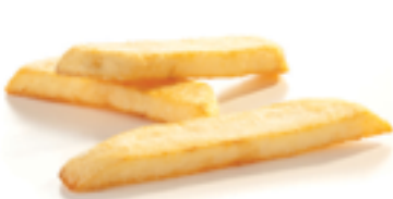
STEAK CUT 56210 34013