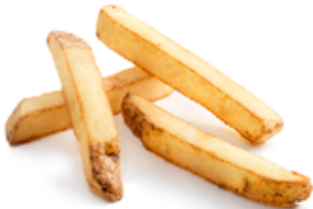
1/2" RUSSET, STRAIGHT CUT SKIN-ON, SEA SALT 56210 04562

Enjoy consistent quality while saving time, labor, and energy costs with these natural, hand-cut looking French fries.