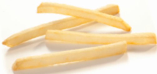
SHOESTRING 56210 32011