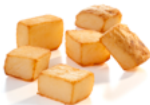
SKIN-ON BREAKFAST BROWNS 56210 30319