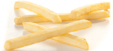
SHOESTRING 56210 34011