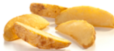
WEDGE, SKIN-ON 56210 04019