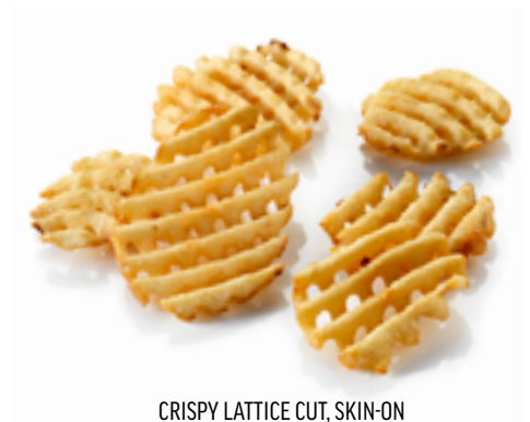
CRISPY LATTICE CUT, SKIN-ON 56210 05208