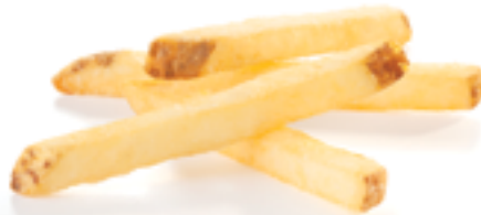
3/8" STRAIGHT CUT SKIN-ON 56210 05606 56210 05506