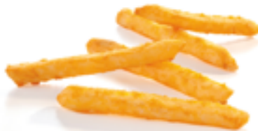
3/8" PUB FRIES™ STRAIGHT CUT, EXTRA CRUNCH 56210 55185