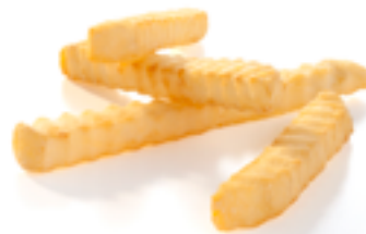
1/2" CRINKLE CUT, XLF 56210 30006