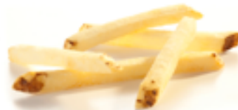
5/16" THIN CUT, SKIN-ON 56210 04501