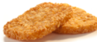
POTATO PATTIES 5-LB BAG 56210 34500