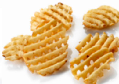
CRISPY LATTICE CUT, SKIN-ON 56210 05508