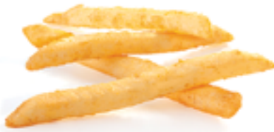
3/8" STRAIGHT CUT 56210 05301 56210 05307** 56210 05601

Golden fries with a buttery texture – Clear Coat products offer a classic French fry taste to suit any menu and any craving. Our crispy Clear Coat coating ensures these fries provide an unbeatable taste every time.