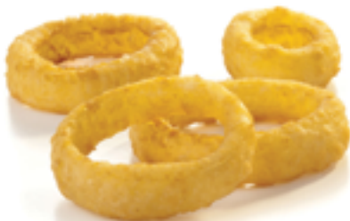
1/2" CRISPY TEMPURA ONION RINGS 56210 15120